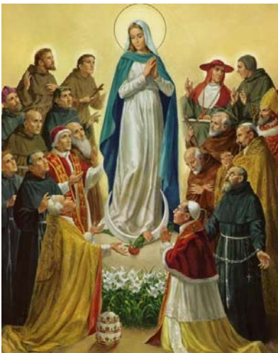
Queen of all Saints